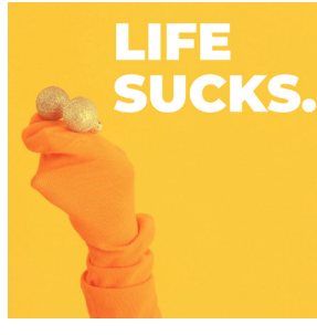
SEP 29-OCT 29