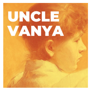
SEP 29-OCT 29