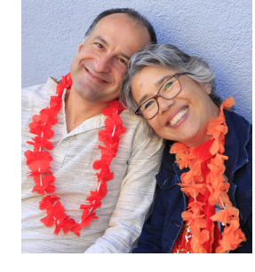
TO CONNECT Take time to mingle, join a community intensive, or stay for a talkback.