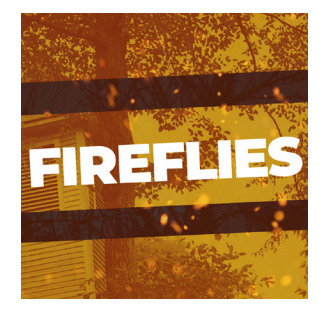
MAR 29-APR 20